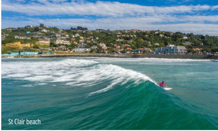
St Clair beach