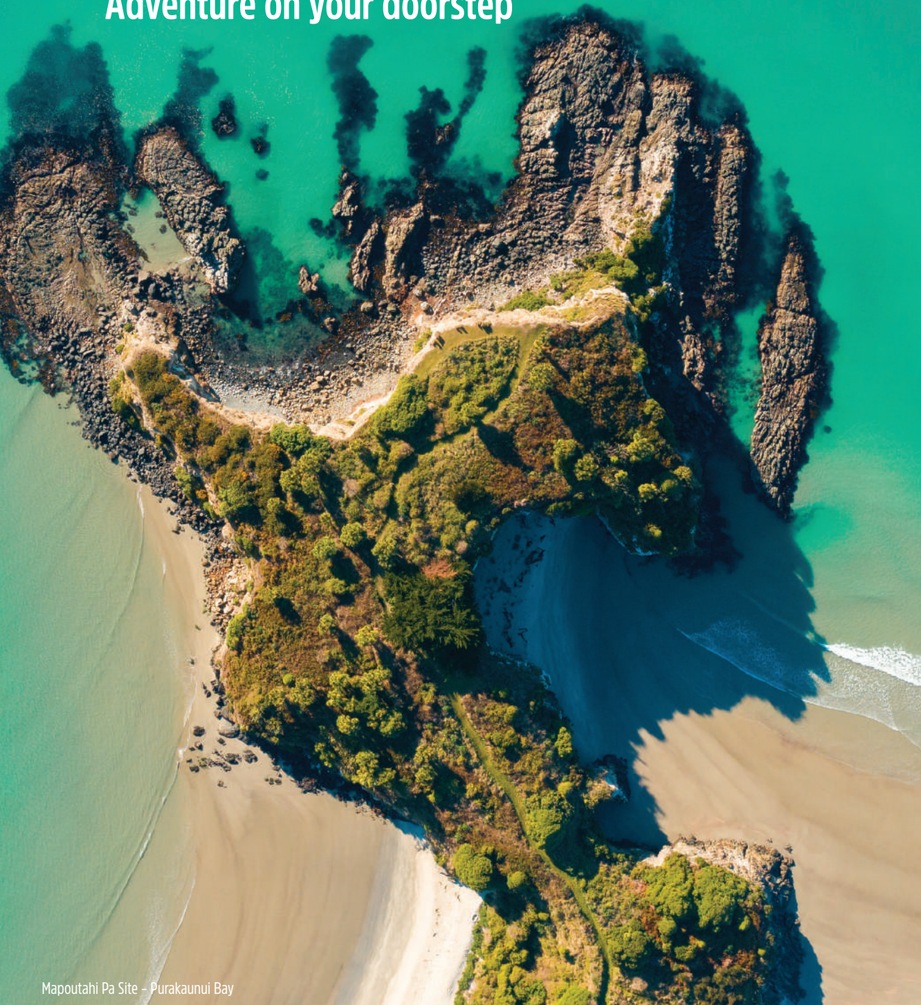
Mapoutahi Pa Site - Purakaunui Bay