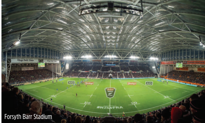
Forsyth Barr Stadium