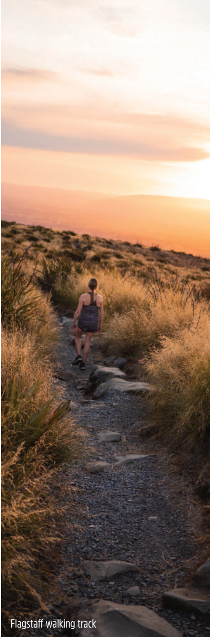
Flagstaff walking track